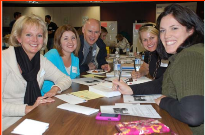
Dedicated Newcastle Staff giving up an evening to support Issaquah School's Foundation's Calling for Kids Program. Thank you for supporting ISF.